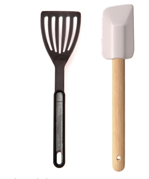
Flexible Turner, Spatula